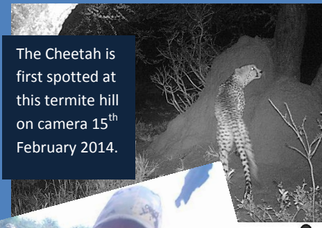
The Cheetah is first spotted at this termite hill on camera 15 th February 2014.