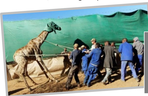
Left: A stubborn giraffe is drawn into the truck by sheer manpower and the help of some rope. Giraffe are tremendously docile if their ears and eyes are shut with cloth. Right: Eland antelope horns are covered with plastic pipes before loading to prevent the animals from hurting each other.