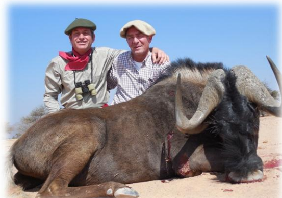
Black Wildebeest – Raul Bergese (Argentina)