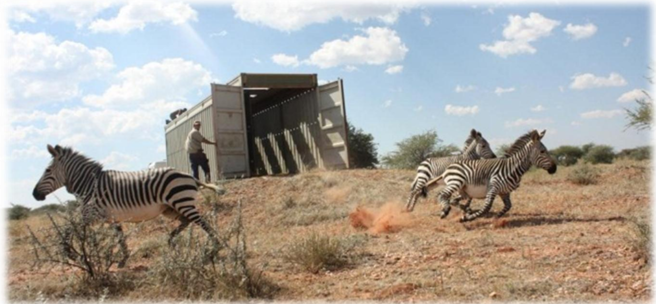
Alex releasing captured Hartmann Zebra on the adjacent property – where more grass is available.