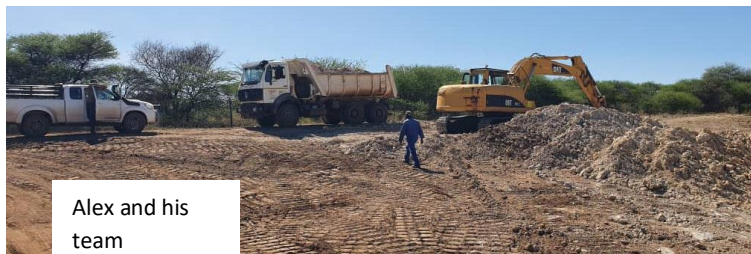
Alex and his team preparing the ground for the solar panel plant!

Namibia is home to many riches, with a thriving mining and fishing industry, but the full potential of perhaps the greatest sustainable resource is now being realized: the Namibian sun. With South Africa (who provides a substantial proportion of Namibia’s electricity requirements) struggling more and more to produce sufficient energy for their own demand, and energy prices steadily rising, it seemed only wise to invest into solar power. Alex grasped the amazing opportunity to build a 10 MW solar plant close to a newly erected sub-station, spanning around 20 000 solar panels, supplying one of the close-by gold mines with energy. His investment into this massive project provides a stable income and the means to sustain our wildlife reserve, that will not depend so much on world politics. In addition, Alex has purchased and set up another 600 solar panels at the lodge, and recently also invested in batteries so that we may go entirely off grid! Struggling with Chinese instruction manuals, second-hand equipment and spending hours and days in the scorching sun, will finally pay off! Well done, engineer Alex, on your revolutionary thinking and relentless enthusiasm for technology!