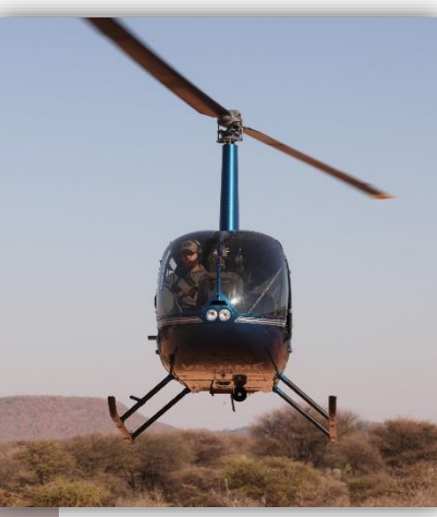
Right: Alex looking over the lush landscape in Angola. This will be the destination for a few of our elephants, scheduled to be transported by truck in August this year.