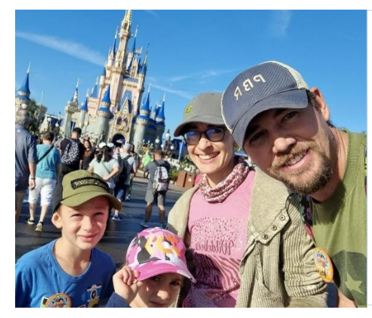
Left: Of all the parks in Disneyworld, the Magic Kingdom was by far the most impressive. From morning until sundown and the help of the 'Genie App', we managed to go on 13 rides in a day. By that time, the parents were worn out...